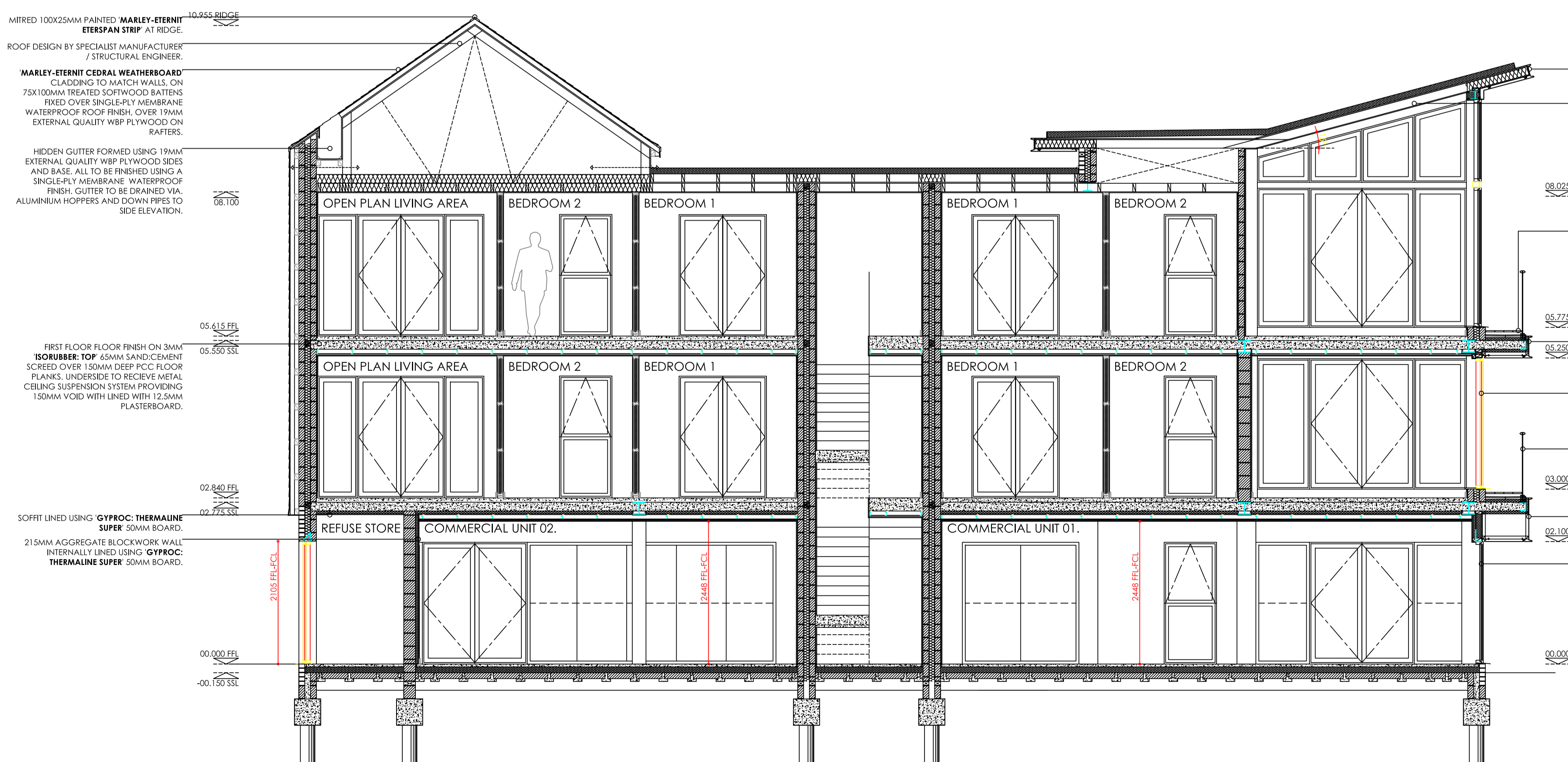
DETAILED SECTION D SCALE 1:50